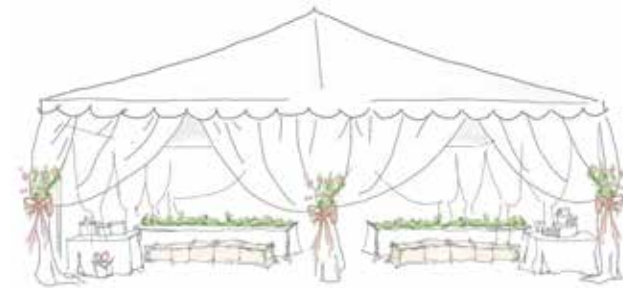
1 The Horse Barn